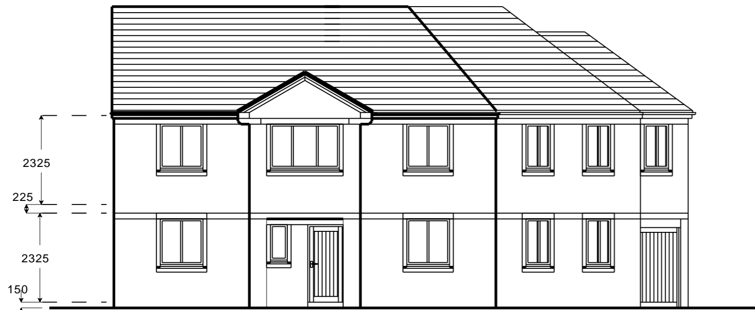
WEST ELEVATION (road side)